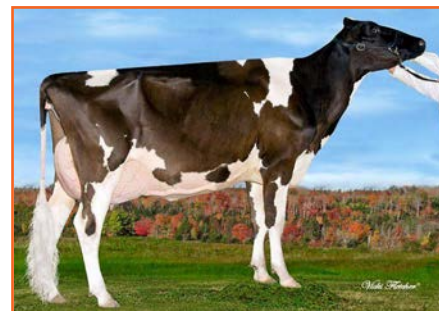
Crestlea Souvergn Elizabeth EX-93 2E 11* 2nd Dam of Lot 118

3rd Dam: HOLLAND HEIGHTS MORTY JOY VG-86