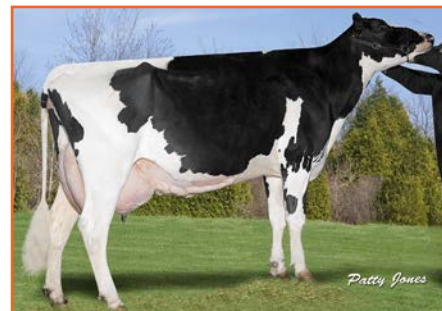
Wendelin Gibson Leera VG-85 21* 3rd Dam of Lot 114