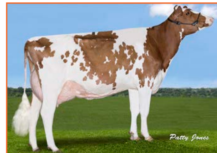
Ruti Moses Apple Red EX 2nd Dam of Lot 113

12th Dam: D-R-A PRINCESS LAD LEADER EX 3E