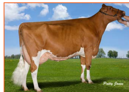
Trinal Joyboy Tammyr EX-91 4E 2nd Dam of Lot 110

3rd Dam: TRINAL TALENT TAZZLYN GP-81 4th Dam: ELM DRIVE RAIDER TAZZ 5th Dam: ELM DRIVER LOCHINVAR TAZZY VG-86 6th Dam: ELM DRIVE LOCHINVAR OLIVE VG-86 7th Dam: ELM DRIVE LOCHINVAR IVY VG-85 8th Dam: ELM DRIVE LOCHINVAR FREDA VG-85