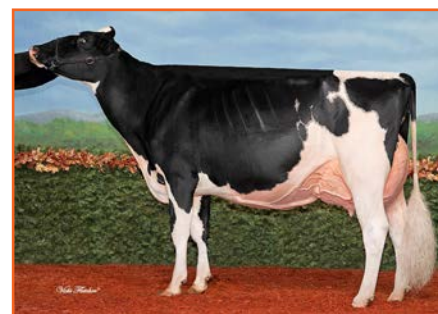
MS Rollnvw Gold Delilah EX-93 2E 2nd Dam of Lot 120

3rd Dam: RICHARDO DUNDEE DAWNETTE EX-95 3E 3* • Res. All-American 5 Yr. Old 2010 • HM All-Canadian 5 Yr. Old 2010 4th Dam: RICHARDO GIBSON DAWN EX-91 2E 5th Dam: MCLEE B STAR DIXIE VG-87 1* 6th Dam: MCLEE TAB DOROTHY VG-86 3* 7th Dam: MCLEE EXCITE DELITE EX 3E