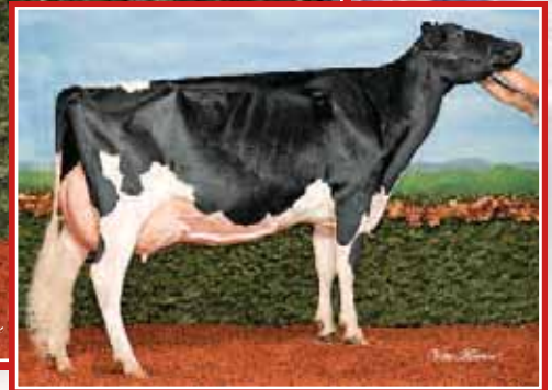
Eastside Lewisdale Gold Missy EX-95 2E 27*

All-Canadian Milking Yearling 2015 1 st Sr. 2-Yr-Old Atlantic Spring Showcase 2016 She sells