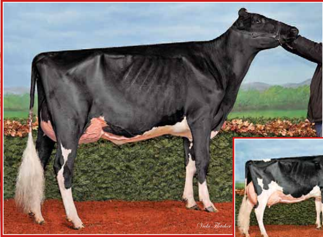
Lewisdale Eastside Atw Amaze EX-91

All-Canadian Milking Yearling 2015 1 st Sr. 2-Yr-Old Atlantic Spring Showcase 2016 She sells