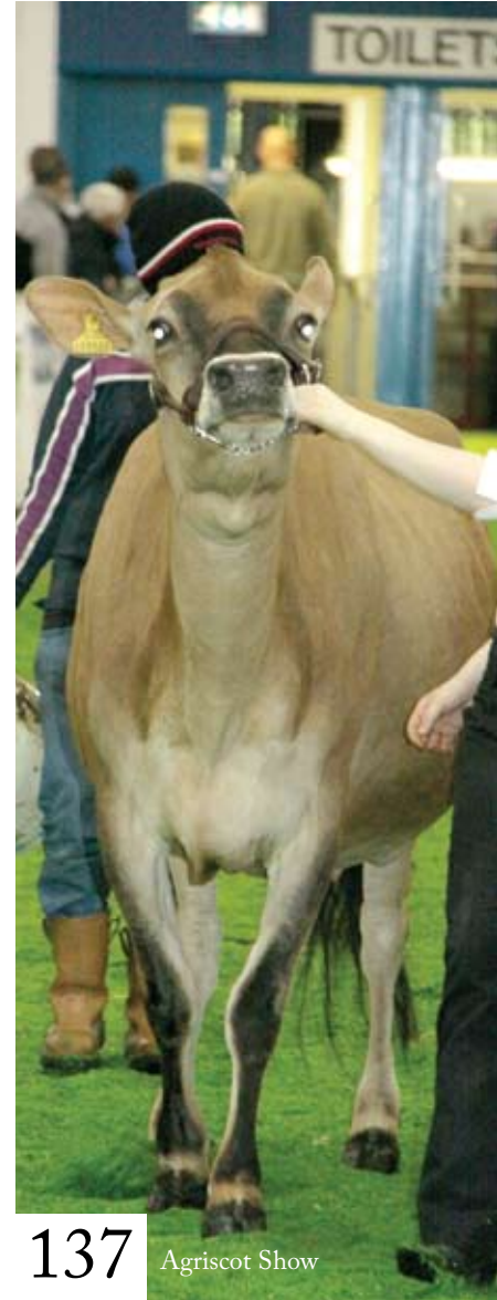
137 Agriscot Show