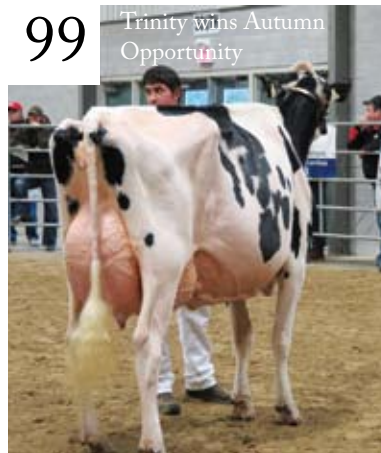
River Valley Dairy – Where Style and Performance are the Standard